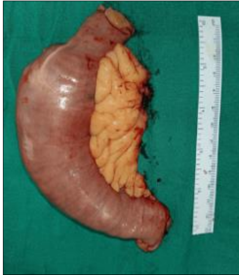
Figure 3 Resected specimen with margin of 3 cm proximal and distal to lump

Histopathological examination reveals submucosal lipoma with ulceration of overlying mucosa, area of fat necrosis and inflammation are seen in lipoma