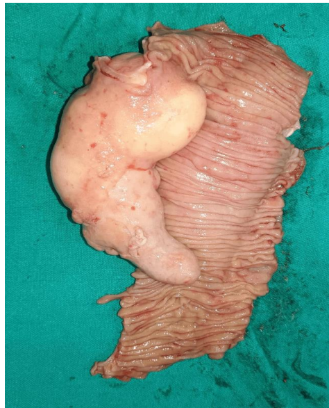
Figure 4 Cut section of specimen. A well lobulated, soft mass arising from anti-mesenteric border jejunum

Histopathological examination reveals submucosal lipoma with ulceration of overlying mucosa, area of fat necrosis and inflammation are seen in lipoma