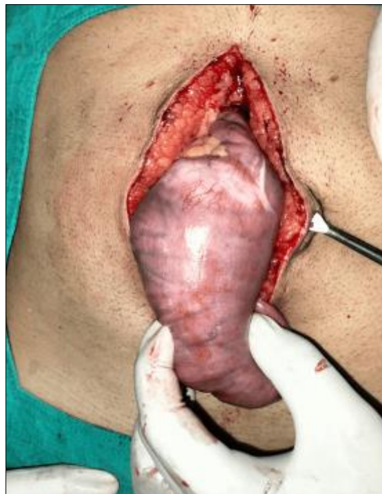
Figure 2 15 x 5 solid mass arising from jejunum on explorative laparotomy

The procedure went smoothly. Externally the lump was soft occupying most of the lumen. The broadest part was proximal and the narrow part distally. There was a narrow passage for the passage of food. On the cut section, a well-defined lobulated mass arising from the antimesenteric border of the jejunum was seen.